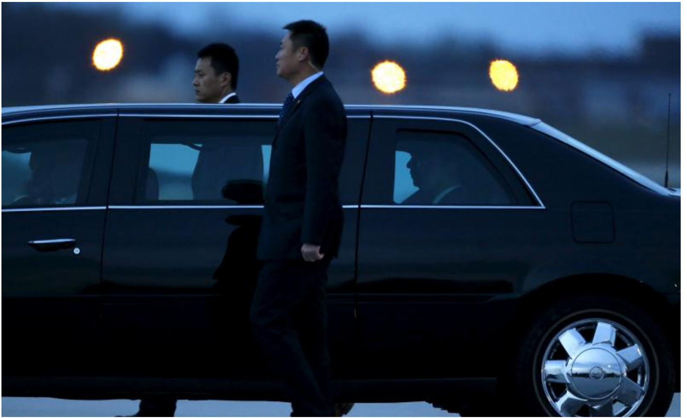
Security agents walk alongside Chinese President Xi Jinping's car at Joint Base Andrews, Maryland, March, 2016.

Indeed, Xi has referred to “the competition with capitalism” and “the protracted nature of contest over the international order.” A party communiqué leaked as Xi came to power in 2013 warned that “the contest between infiltration and anti-infiltration efforts in the ideological sphere is as severe as