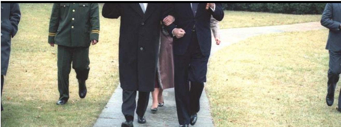
U.S. President Ronald Reagan walking with Chinese Premier Zhao Ziyang during his visit to the White House, January, 1984.

Later that month, with order restored across the country, party leaders denounced Zhao. They pointed to his engagement with foreign economists as evidence of his alleged mission to push China to abandon socialism. Eliminating this pernicious influence would from then on require omitting any mention of both Zhao himself and the role of his many Western advisers. Today, his